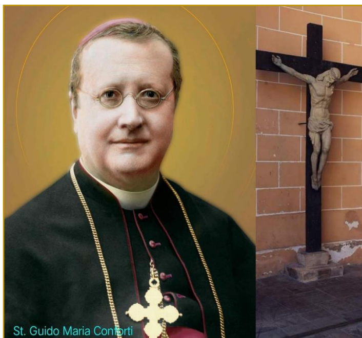
St. Guido Maria Conforti

– Relationship with Our Benefactors. We express our thankfulness for supporting us by sending greetings on special occasions, such as birthdays, Christmas, Easter, and anniversaries. In March, we will have a meeting with them.